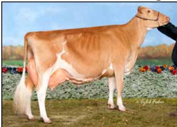
KNAPPS REGIS TAMBOURINE-ET, EX-95 UNAN ALL-AMERICAN AGED COW, 2015 • 3X UNAN ALL-AMERICAN 2015 GLOBAL GUERNSEY COW OF THE YEAR MATERNAL SISTER OF LOT G1