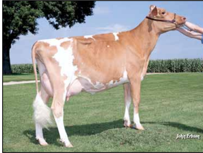
ROLLING PRAIRIE YOGIBEAR LEGAL, VG-87 4-01 365D 30,480M 3.9% 1174F 3.1% 941P DAM OF LOT G2