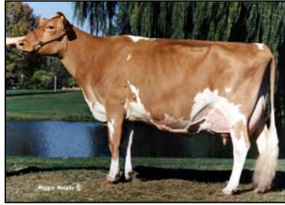
WESTLYNN TOM DEE, EX-96 4X WDE GRAND CHAMPION 5TH DAM OF LOT G3