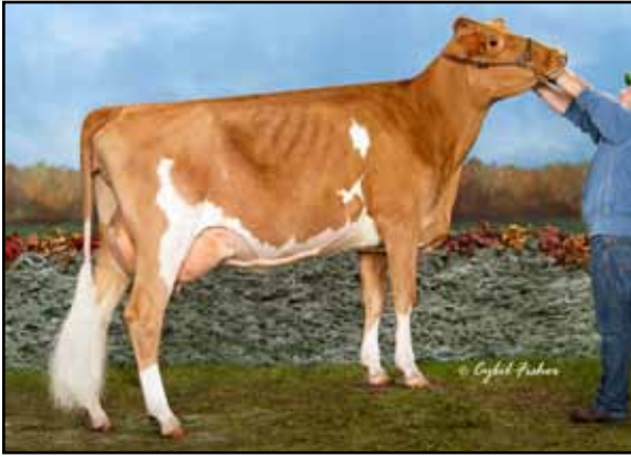
KNAPPS JACKSON JADEEJACK, EX-90 NOM JR ALL-AMERICAN JR 2-YEAR-OLD, 2014 DAM OF LOT G3