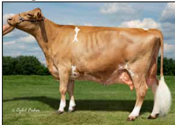
KNAPPS ACE TAMERA, EX-93 9-07 365D 32,350M 4.2% 1351F 3.2% 1036P DAM OF LOT G1