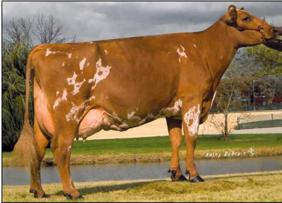
SHIREDALE PHIL'S SUSAN, EX-93 3E UNAN ALL-AMERICAN 4-YEAR-OLD, 2010 MATERNAL FAMILY MEMBER OF LOT 25