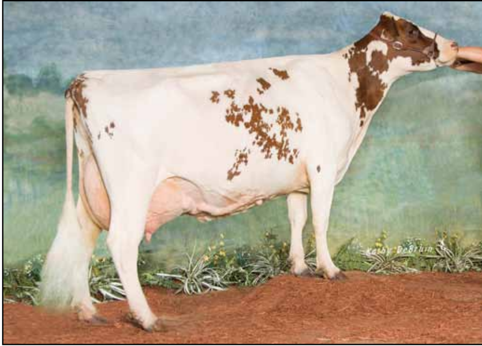
MILLER'S LAREDO TERESA, EX-90 6-09 365D 28,490M 4.1% 1169F 3.4% 975P GREAT-GRANDDAM OF LOT 10