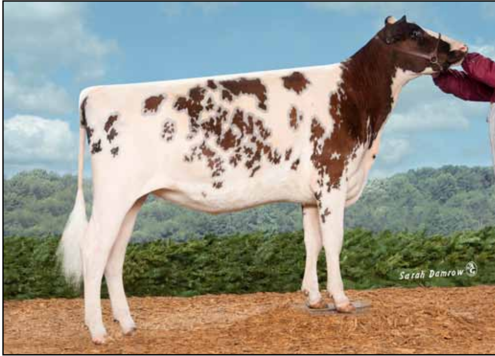
LAZY M WHAMMY SUMMER SHANDY NOM JR ALL-AMERICAN SPRING YEARLING, 2014 MATERNAL SISTER OF LOT 20