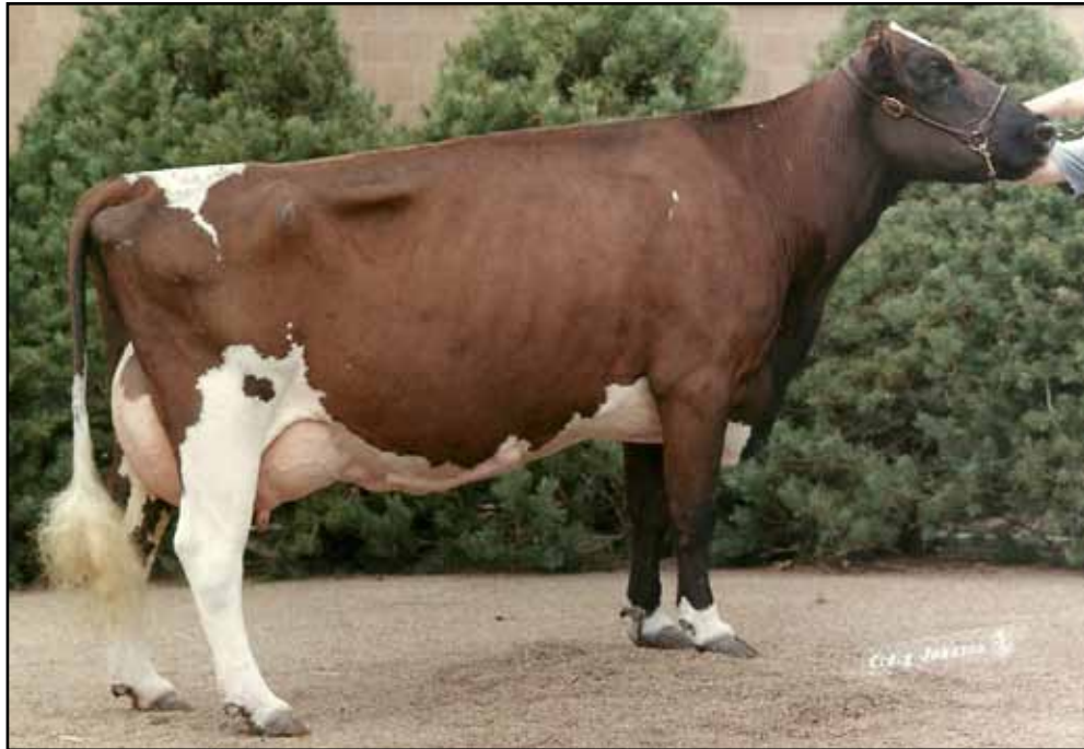
HAWKSFIELD IDA 10, EX-92 5-08 305D 20,430M 5.1% 1049F 3.4% 688P 5TH DAM OF LOT 23