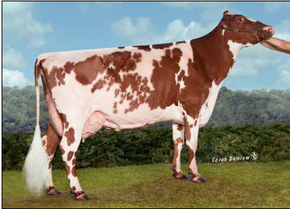
DAN SAL MEGADETH ZENA, EX-94 2E RES. ALL-AMERICAN AGED COW, 2012 5-05 365D 23,520M 3.9% 909F 2.9% 675P GREAT-GRANDDAM OF LOT MS11