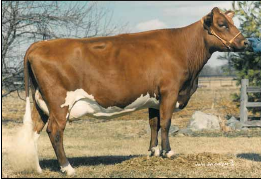
HAWKSFIELD MONA CRIMSON, EX-90 6-06 365D 22,210M 6.0% 1326F 3.3% 726P GREAT-GRANDDAM OF LOT 13