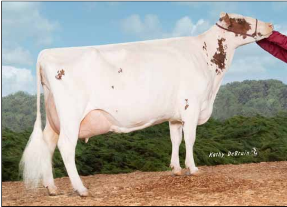
MILL-VALLEY PANDELARO TAFFEY RESERVE GRAND CHAMPION, 2011 SOUTHERN NATIONAL JR SHOW GRANDDAM OF LOT 24